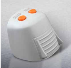
Battery cover with wings