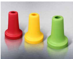
Extra nose pieces