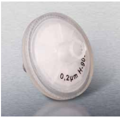
Hydrophobic PTFE filters