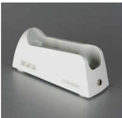
3 position charging stand