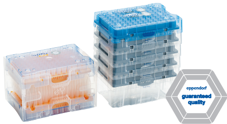
022491504 – 10 µL S Tip Reload