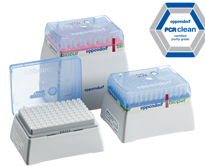
022491806 – 10 µL S Tip (PCR Clean)