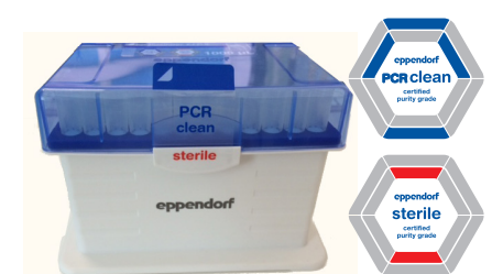
0030078500 – 10 µL S Tip (Filter)