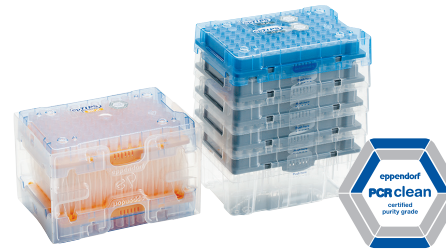
022491709 – 10 µL S Tip Reload