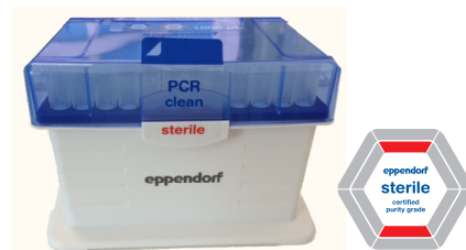
0030071557 – 10 µL M Tip (Sterile)